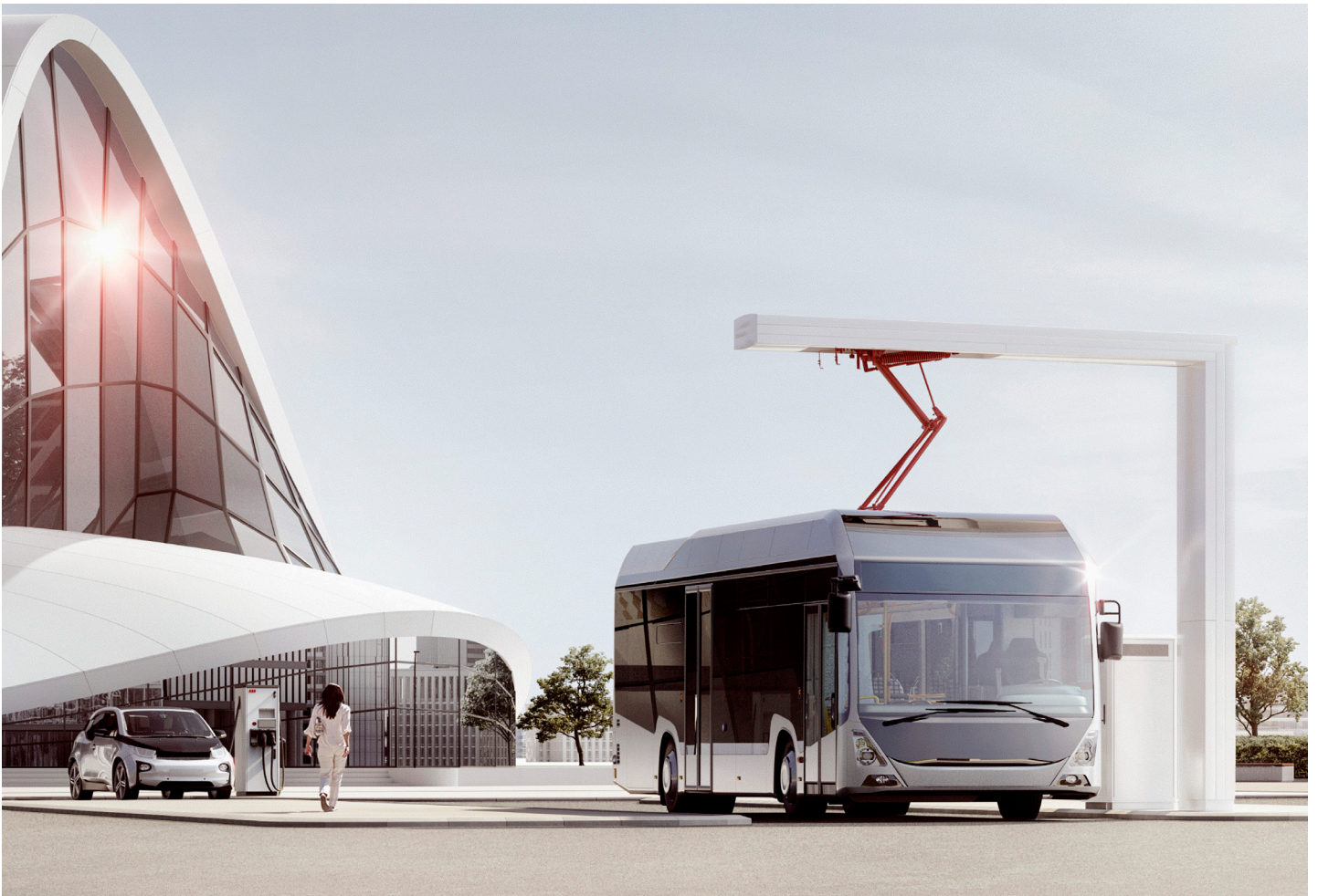
ABB Power Grids Switzerland Ltd Semiconductors Fabrikstrasse 3 5600 Lenzburg, Switzerland